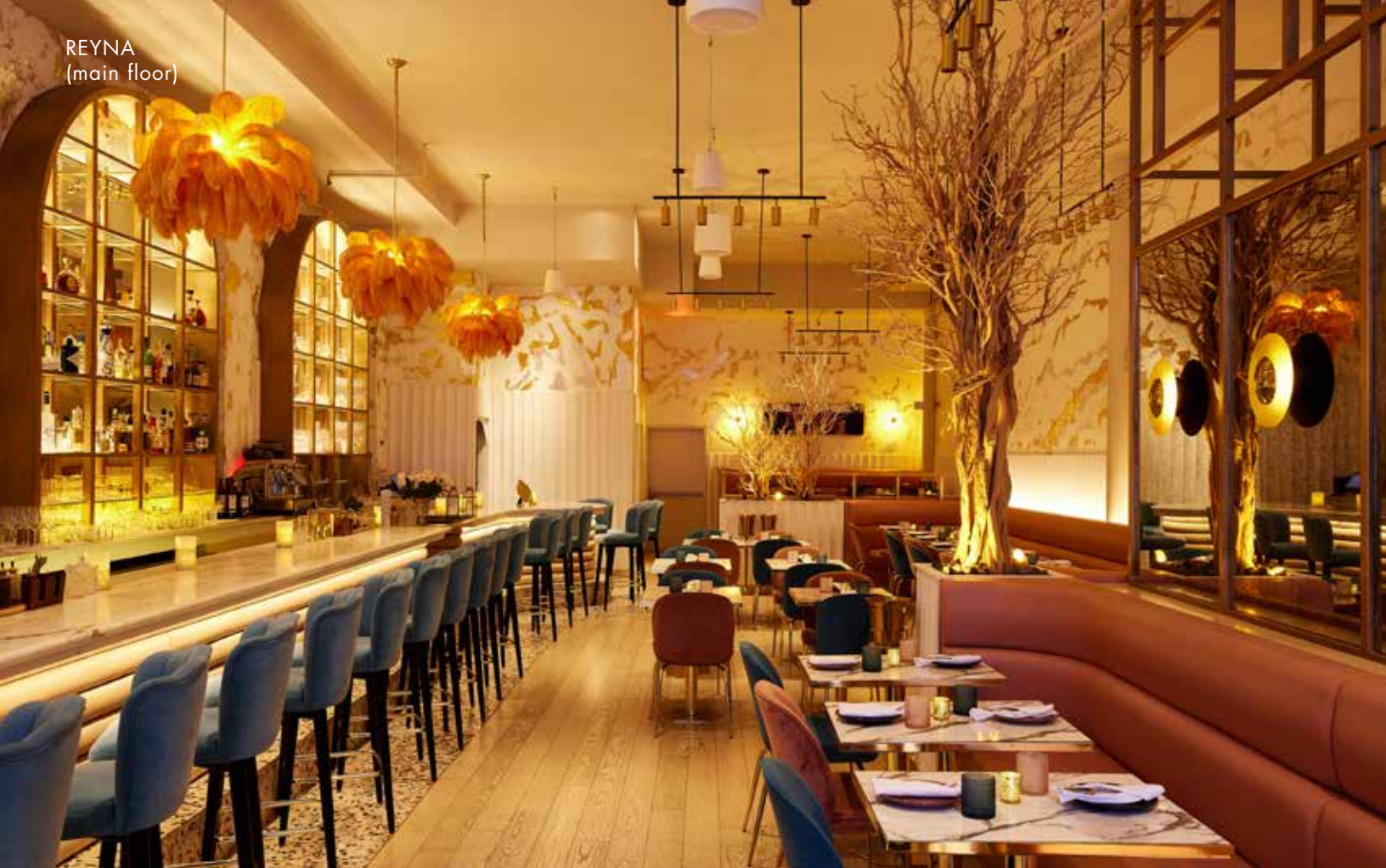
REYNA (main floor)